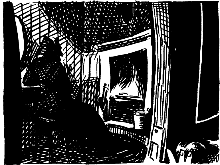
When I opened the door of my room, there was a woman sitting near the fire. She was about forty years old.

I cried out for help and soon Lord Glenfallen arrived. I ran out of the room as he ran in, and I waited outside to listen at the door. I did not hear every word but I knew that Lord Glenfallen was very