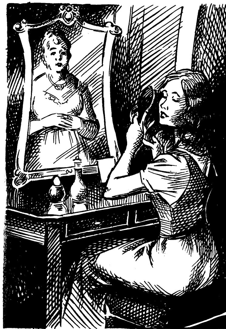
'Lord Glenfallen? He's that ugly old man from Cahergillagh.'

'Come, my love,' said my husband. 'You must come in and meet Martha. She cooks and cleans and knows everything about the house.' So we went into the house and I met Martha, a