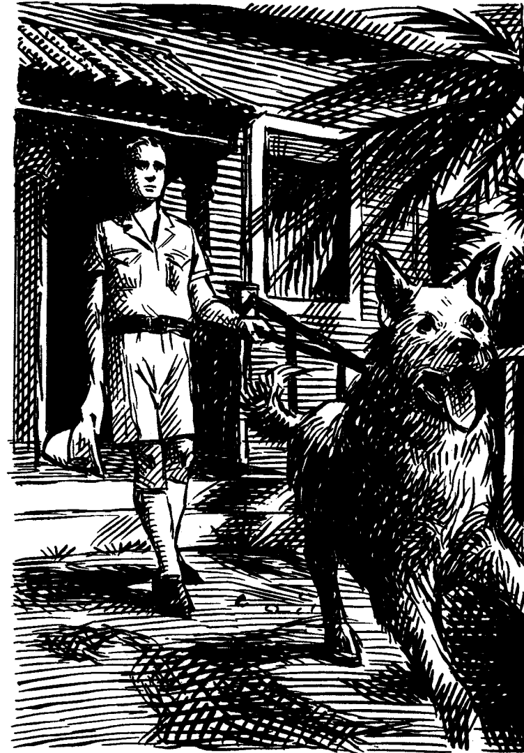
Tietjens always went to work with Strickland and often helped him in his police work, so the people of the town were quite afraid of her.

Imray's house stood un-lived-in and quiet for three or four long, hot summer months. The hottest weather was finished when my friend Strickland, a policeman, moved to live in it. People said that Strickland was a very strange man but I always went to see him and have dinner with him when I was in the town working for a day or two. He had one or two other friends too; he liked his guns, he liked fishing and he liked his dog – a very big dog, called Tietjens. Tietjens always went to work with Strickland and often helped him in his police work, so the people of the town were quite afraid of her. Tietjens moved into the house with Strickland and she took the room next to Strickland's, where she had her food and where she slept.