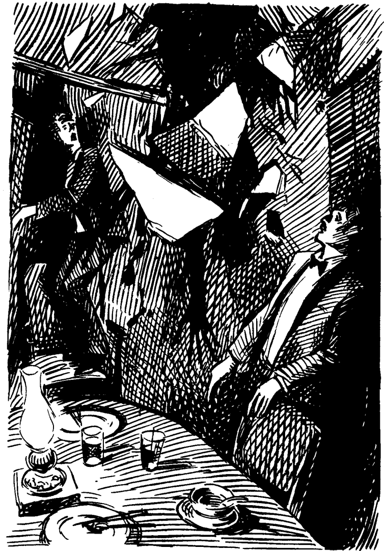
Something hit the centre of the ceiling hard from above, broke noisily through it into the room and hit the dinner table.

I jumped back. Something hit the centre of the ceiling hard from above, broke noisily through it into the room and hit the dinner table. It broke some glasses and plates on the table. There was water all over the floor. I went over with the light and looked down at the thing on the table. Strickland climbed quickly off