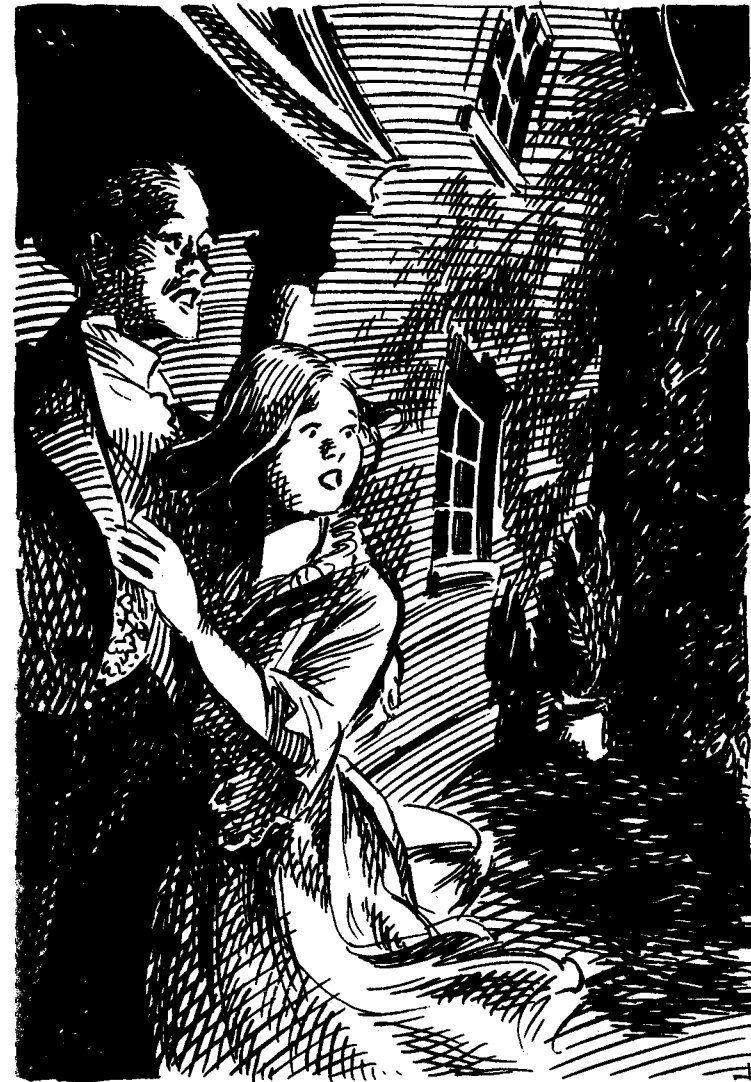
We heard a noise, somebody crying, far away in the night. But we saw nothing. There were no lights and no people there.

In Dublin, I began to be happier. I met a lot of friendly people and I went dancing every evening. A lot of young men came to speak to me and asked me to dance; I liked talking to them. I