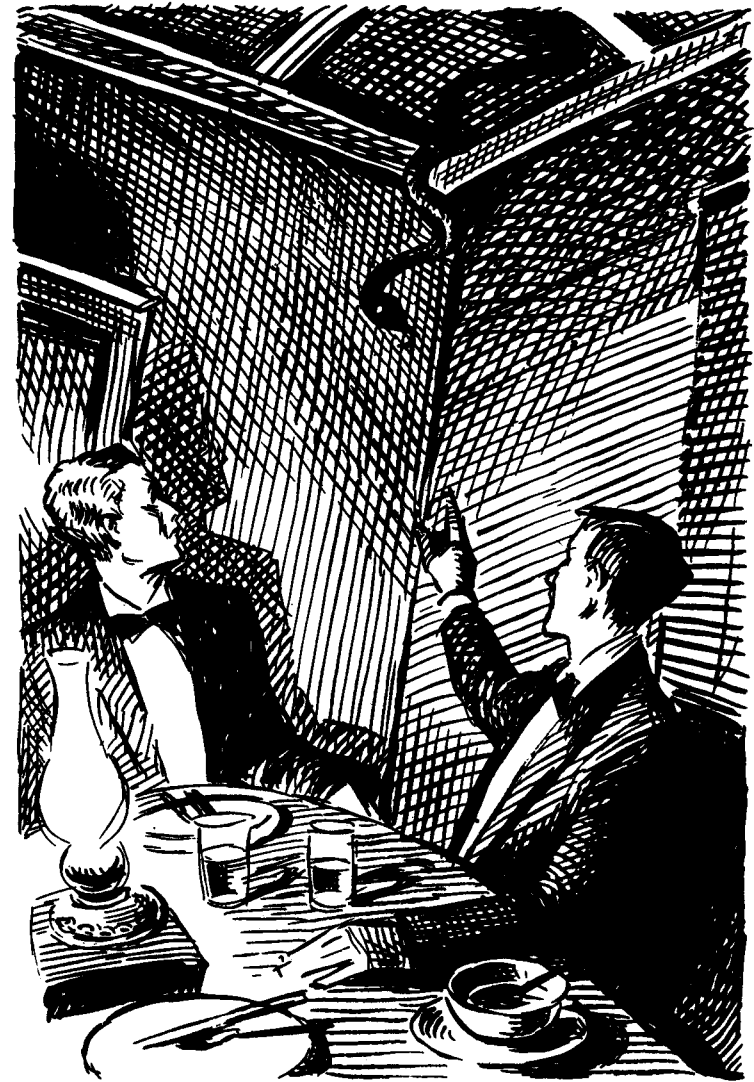
There was the head of a very dangerous brown snake, called a 'karait' in India, looking at us with cold eyes from a small door in the corner of the ceiling.

I turned and looked up. There was the head of a very