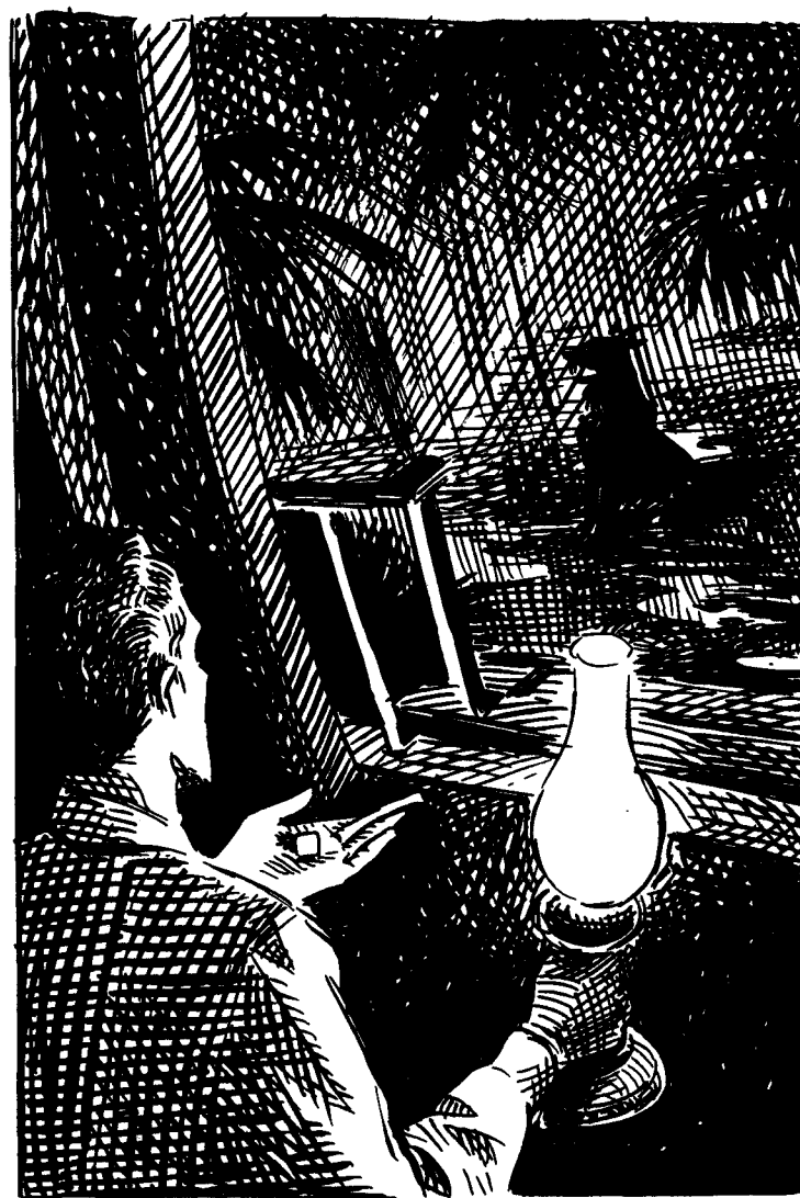
Tietjens was outside in the rain, very wet. Strickland called her again and again, but she did not want to come in.

The rain started and stopped again all night, but Tietjens stayed outside. She slept near my bedroom window and I heard her moving about. I slept very lightly and I had bad dreams. In my half-sleep I dreamt that somebody was calling to me in the night, asking me to come to them, to help them. Then I woke up, cold with fear, and found there was nobody there. Once in the night I looked out of the window and saw the big dog out there in the