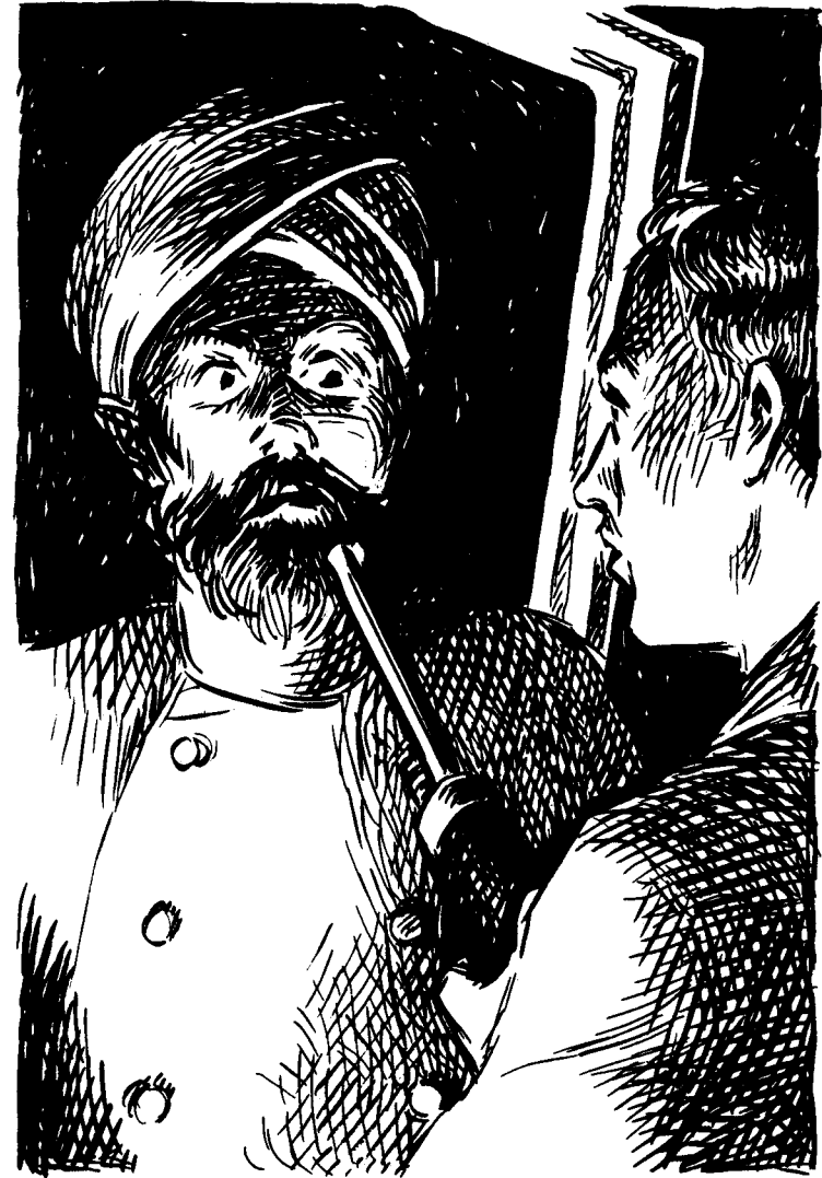
Strickland took his gun off the floor and stood up quickly. He pushed the gun into Bahadur Khan's face.

He moved back from the table and showed us his foot. There was the head of the brown snake, the deadly 'karait', with its teeth in his foot.