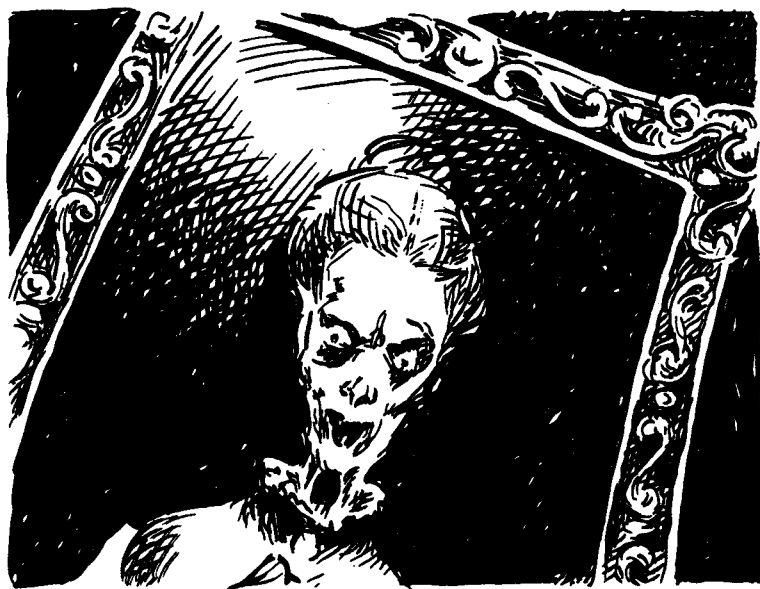
One picture was of Mrs Stone, old and with white hair, as she often was in my dream.

John Clinton came back to tell me dinner was ready. 'I don't like this picture, John,' I said. 'I'm going to have bad dreams tonight if it stays in here. Can we move it outside?'