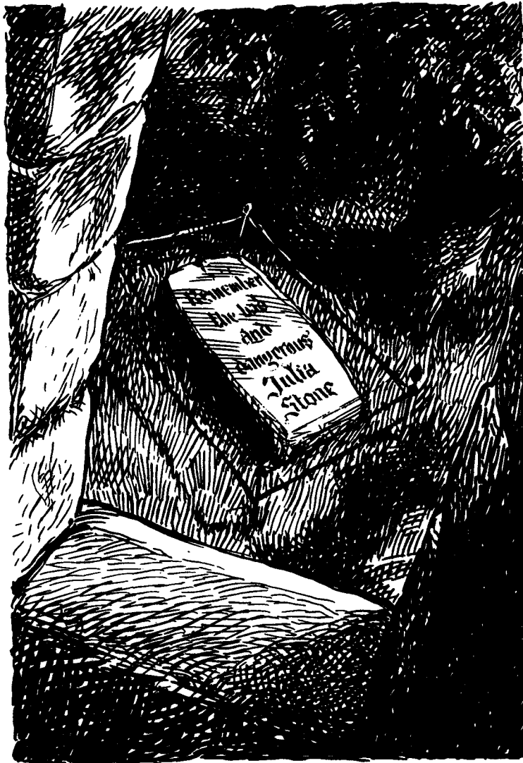
There was a stone in the centre of the garden, under a tree, with these words on it: 'Remember the bad and dangerous Julia Stone'.

it's a very nice place where we can walk and swim. We can drive down together on Sunday afternoon.'