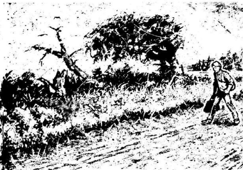
Before I was halfway to town, there was Tom Sawyer coming along.

'All right,' I said, 'but there's another thing. You know old Miss Watson's slave Jim, who ran away? Well, he's a prisoner here, and I'm going to help him escape.'