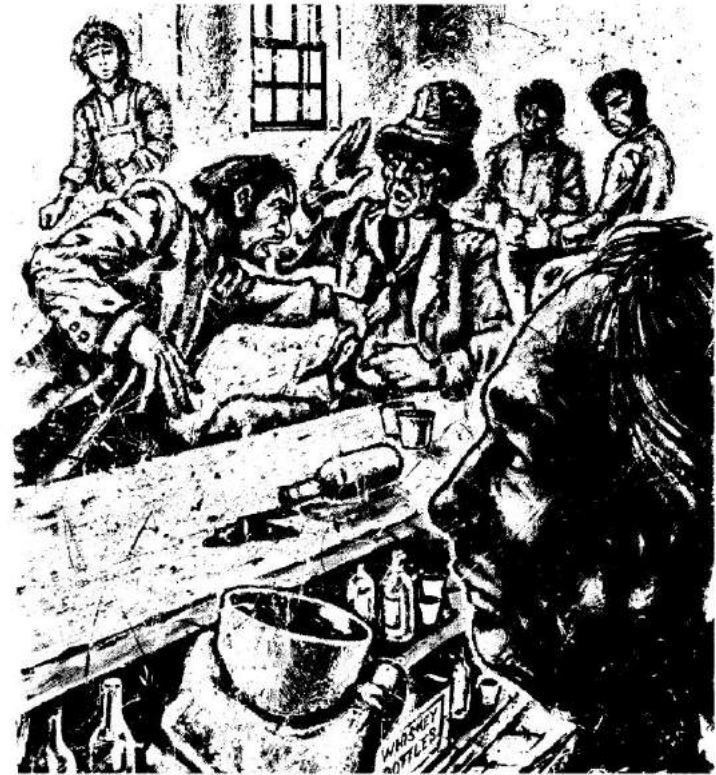
We found the King in a bar, drunk.

'Now we can get away from them,' I thought. I turned