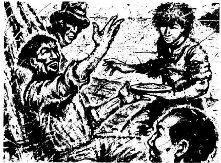
'Bring me my dinner!' said the Duke.

So we did things for him, and he liked it. But the old man