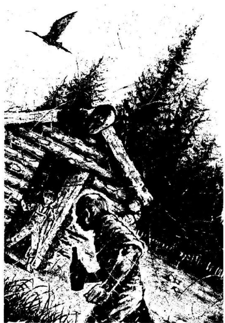
I had to stay with him in a hut in the woods.

The next day he was drunk, and he went to Judge Thatcher to get my money. The judge wouldn't give it to him. But Pop didn't stop trying and every few days I got two or three dollars from the judge to stop Pop from hitting me. But when Pop had money, he got drunk again and made trouble in town. He was always coming to the widow's house, and she got angry and told him to stay away. Then Pop got really angry and one day he caught me and took me a long way up the river in a boat. I had to stay with him in a hut in the woods and I couldn't go out by myself. He watched me all the time. The widow sent a man to find me and bring me home, but Pop went after him with a gun, and the man ran away.