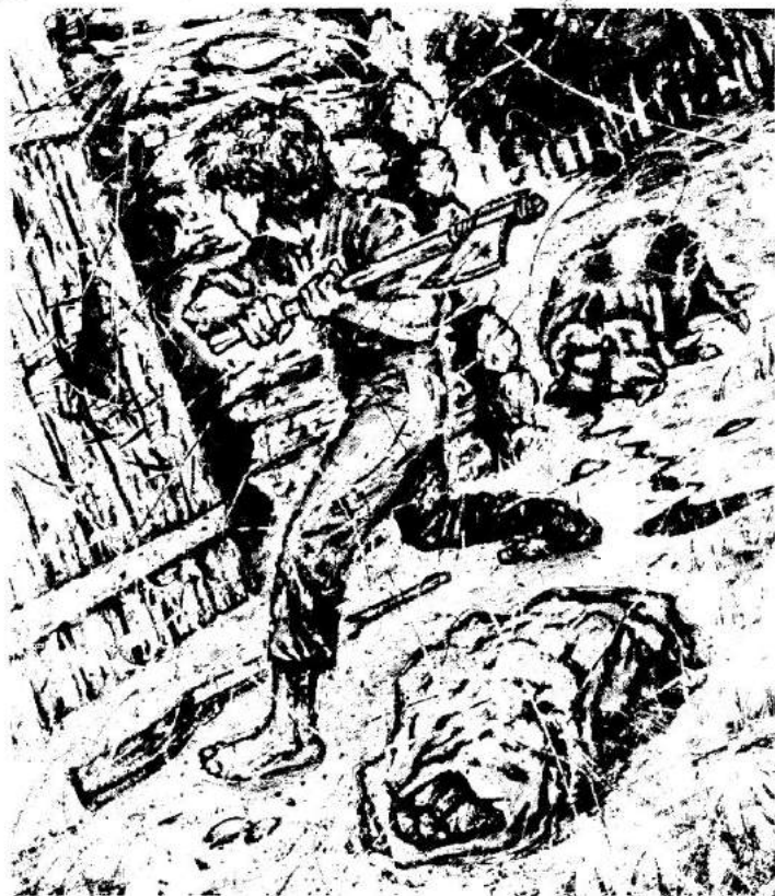
I broke down the door with an axe.

went into the woods. There I shot a wild pig and took it back to the hut with me. Next, I broke down the door with an axe. I carried the pig into the hut and put some of its blood on the ground. Then I put some big stones in a sack and pulled it along behind me to the river. Last of all, I put some