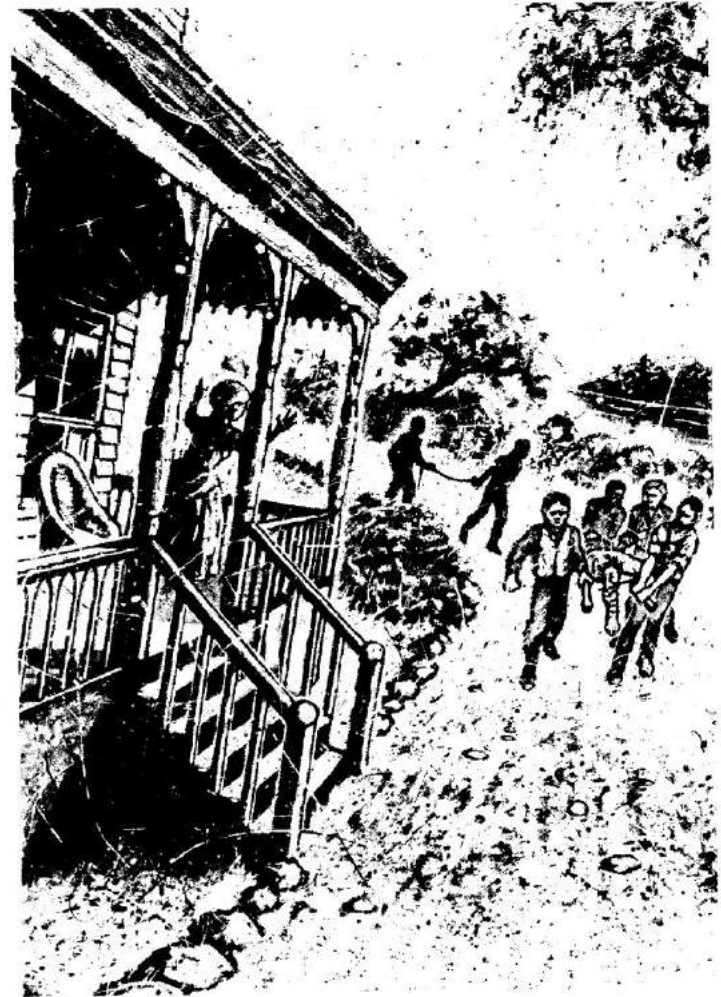
They carried Tom home to the Phelps's house – and they brought Jim too.

When Tom woke up the next day, he felt better. I was in the room and he said to me, 'Jim's all right, isn't he?'