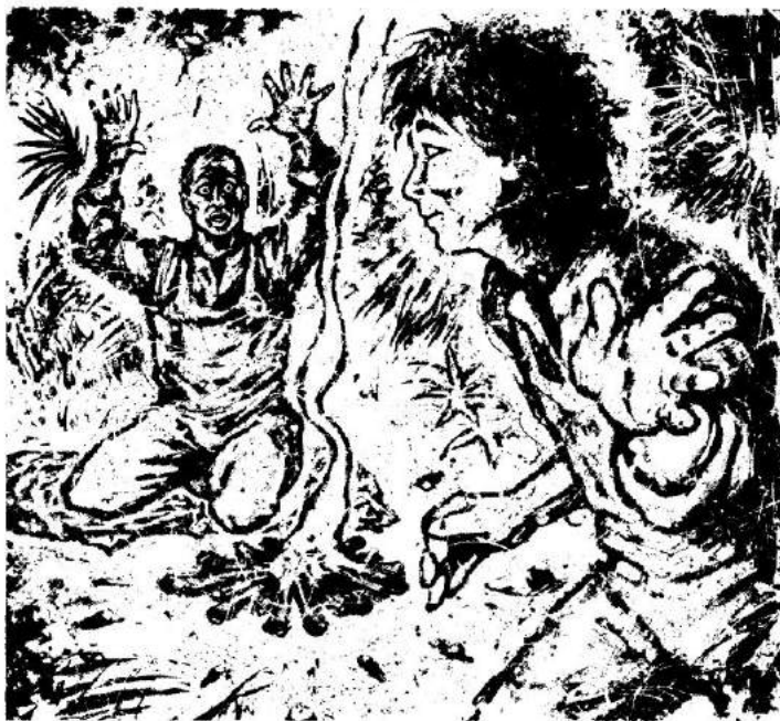
Jim fell to his knees. 'Please don't hurt me!' he cried.

Jim fell to his knees. 'Please don't hurt me!' he cried. 'I've always been good to dead people!'