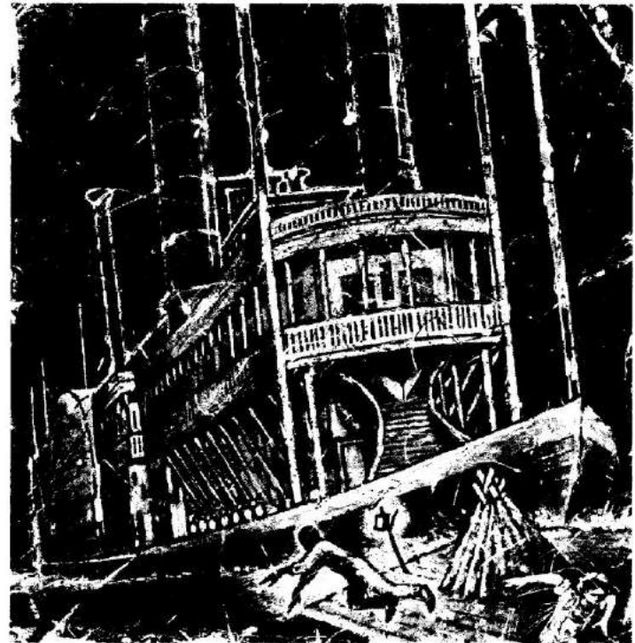
The next minute the steamboat was right over us.

Well, the people who lived in that house were very kind, and they took me in and gave me some new clothes and a