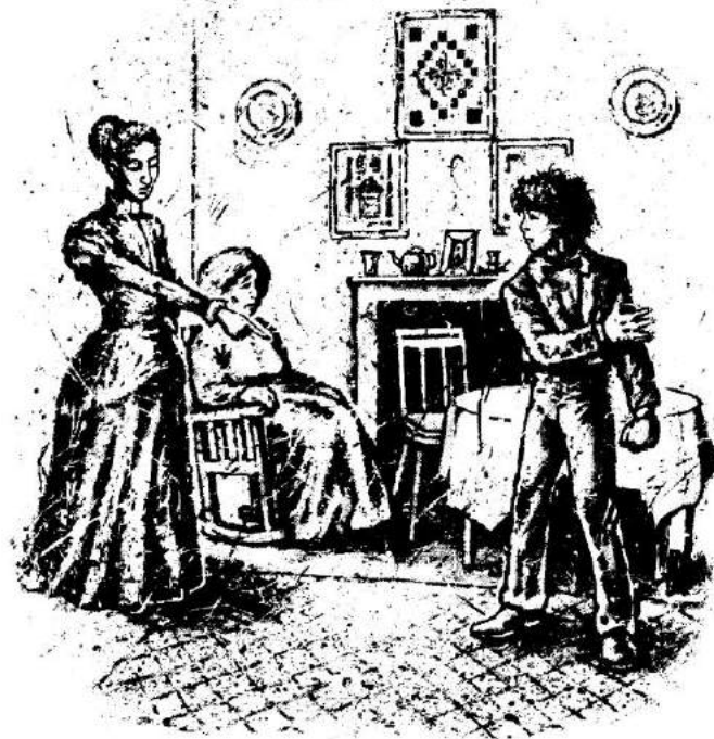
Miss Watson was angry, but the widow just looked unhappy.

Time went on and winter came. I went to school most of the time and I was learning to read and write a little. It wasn't too bad, and the widow was pleased with me. Miss Watson had a slave, an old man called Jim, and he and I were good friends. I often sat talking to Jim, but I still didn't like living in a house and sleeping in a bed.