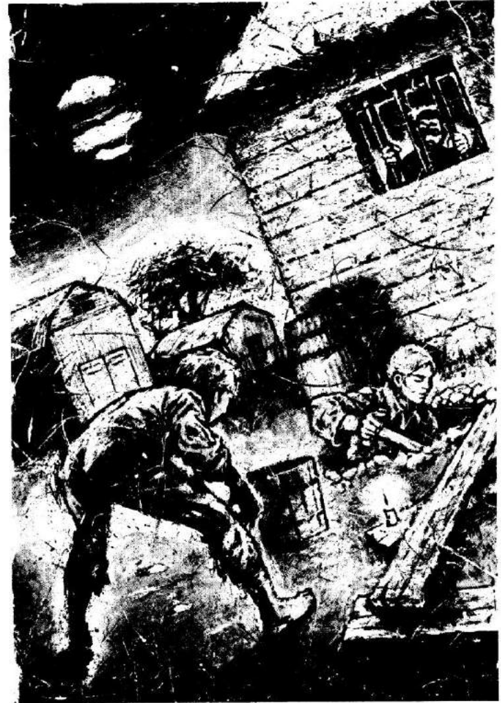
We dug a hole right under the wall of the hut.