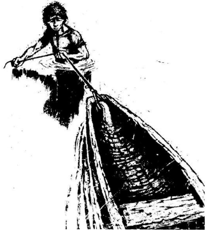
I jumped into the river and brought the canoe to the side.

That afternoon, Pop locked me in and went off to town.