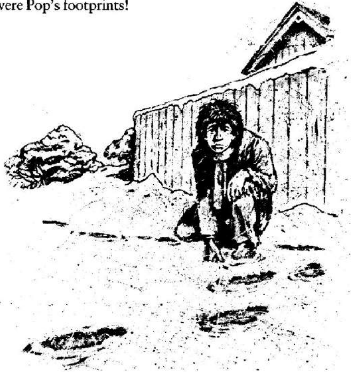
They were Pop's footprints!

Then, one morning, there was some new snow on the ground and outside the back garden I could see footprints in the snow. I went out to look at them more carefully. They were Pop's footprints!