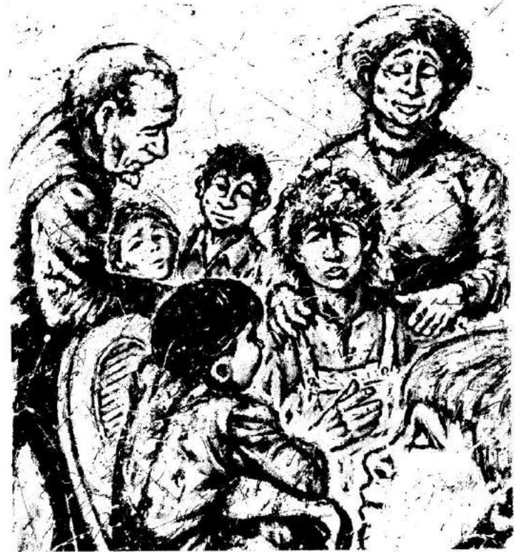
We all sat there talking and I could answer all their questions.

We all sat there talking and I could answer all their questions about the Sawyer family. I was feeling really