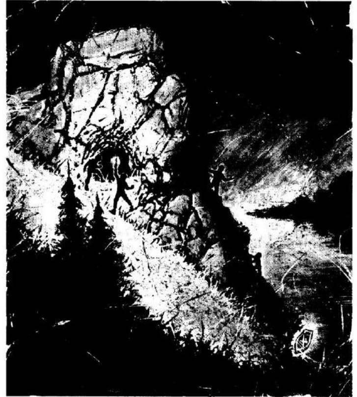
Tom's secret place was a cave, deep in the side of a hill.

'Now, we'll have this gang of robbers,' he said, 'and we'll call it Tom Sawyer's Gang. If somebody hurts one of us, the others will kill him and his family. And if a boy from the