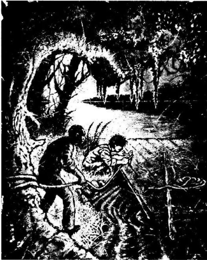
We tied the raft up under the trees.

and was about four metres by five metres. 'This could be useful,' I said to Jim, so we pulled it back to the island behind the canoe, and tied it up under the trees.